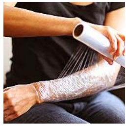
How To Treat